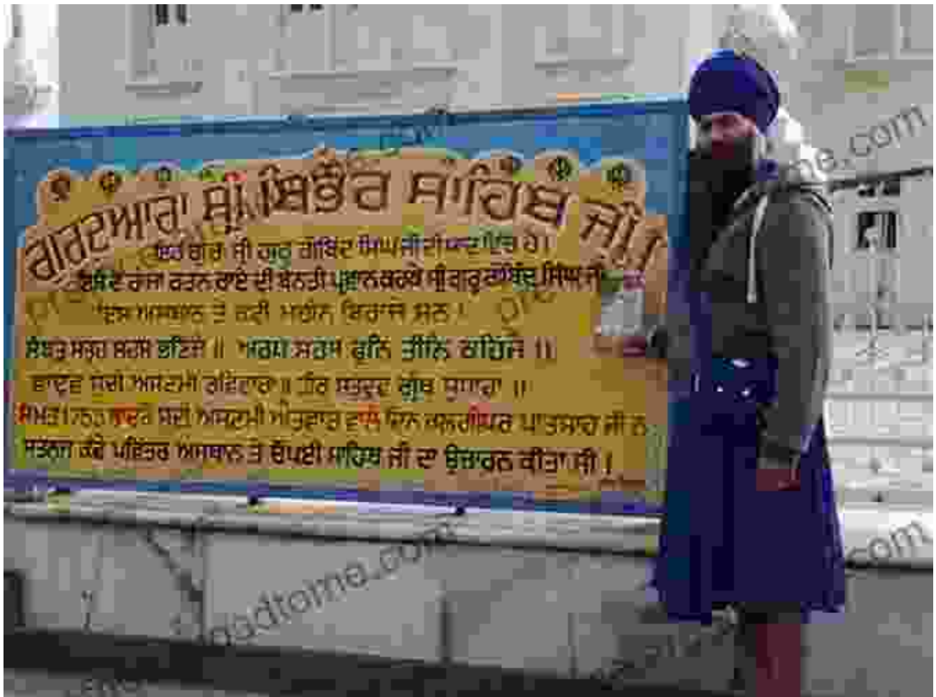
Debate on the Dasam Granth

The debate over authorship is intertwined with questions of canonicity and the authority of the text within Sikhism. The inclusion of the Dasam Granth in the Sikh scripture, alongside the Guru Granth Sahib, has been both embraced and contested by different Sikh denominations, adding further layers to the complexities surrounding its status.