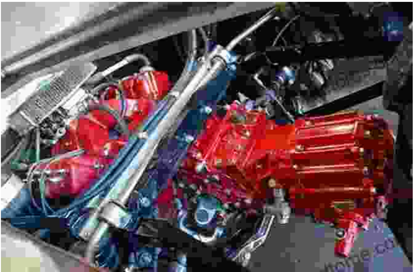
The De Tomaso Mangusta's powerful Ford V8 engine